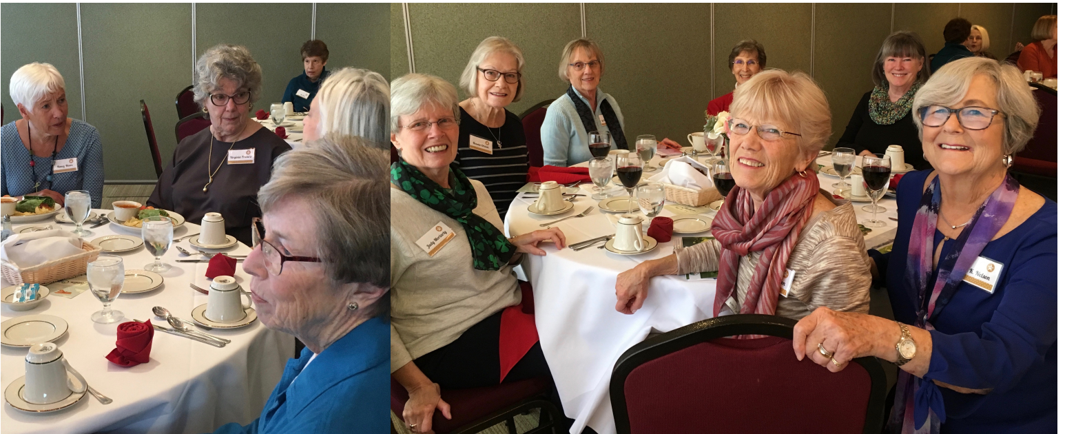
BL in Touch March 13, 2019 at Blackhawk Country Club Thirty sisters met at the Blackhawk Country Club for lunch.