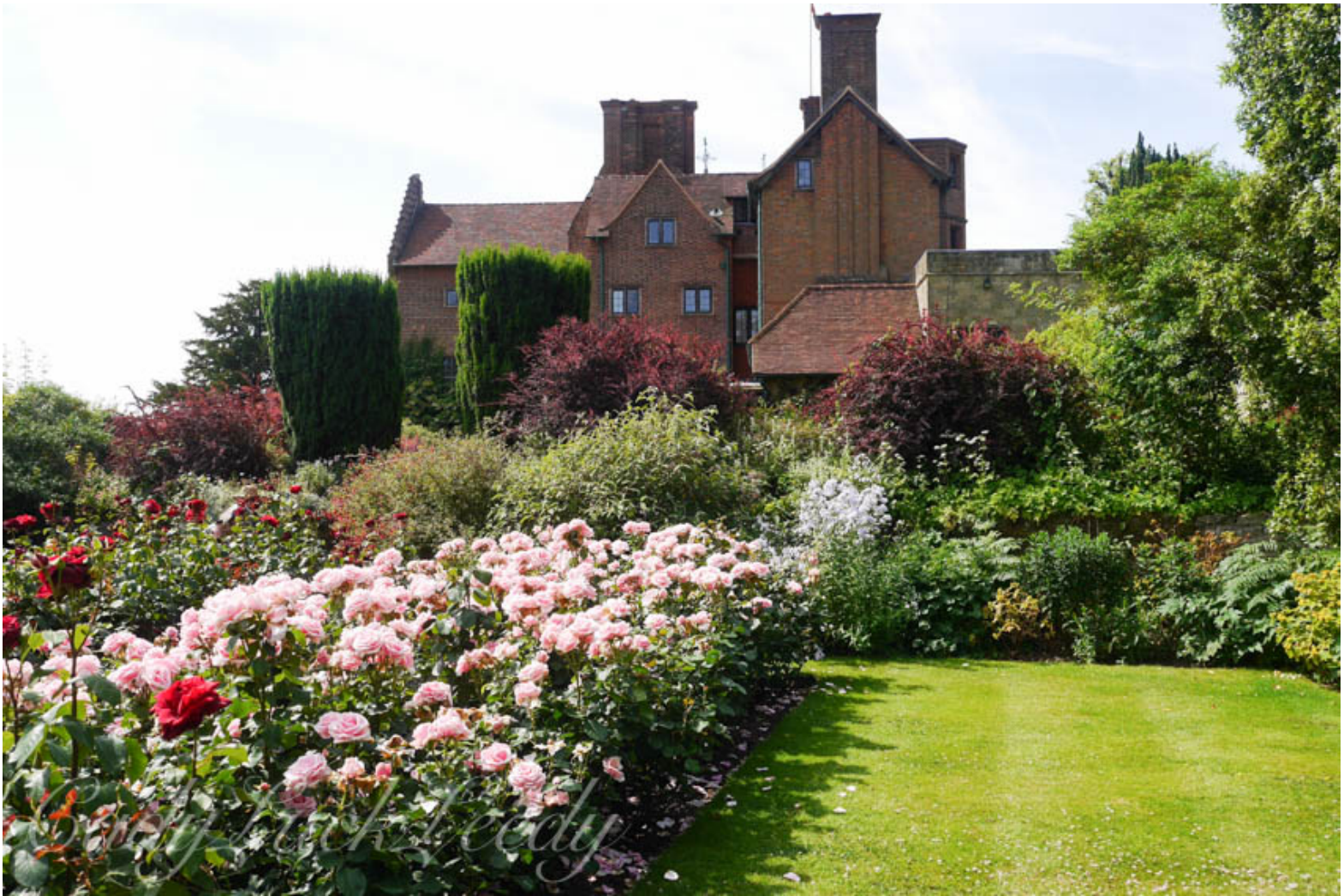
Chartwell Manor and gardens, former home to Sir Winston Churchill