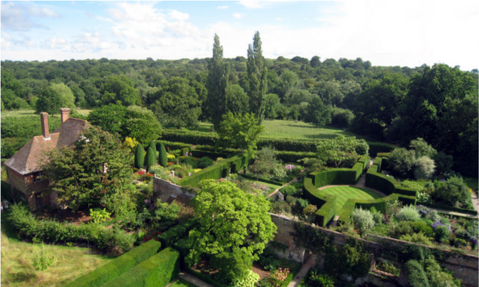
Sissinghurst Castle and Gardens above, Leeds Castle and Gardens below