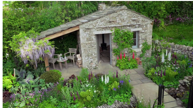
Two displays at the 2018 annual Chelsea Garden Show above